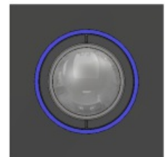
Trackball light ring Illuminated