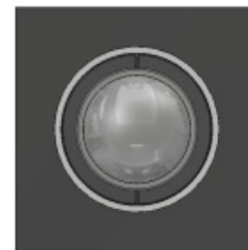
Trackball light ring Non-illuminated

The X50 Series HALO trackball provides all the features of the standard X50 trackball module with the inclusion of an illuminated ring surrounding the ball. The light ring provides an excellent means of locating the trackball in low level light environments and also serves as an aesthetic feature to compliment other illuminated components incorporated within a user interface panel. The figures show the HALO feature in its powered and non-powered state.