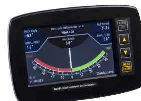
Panel mounting model