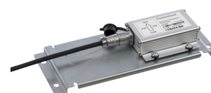
Sensor Unit with mounting plate