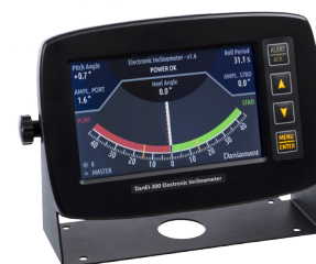
Bracket mounting model