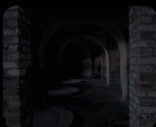
LOW LIGHT – LYYN gives you a clearer vision