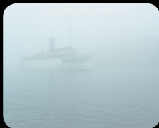
FOG & HAZE – LYYN gives you a clearer vision

As LYYN can be integrated into existing systems as a "turbo charger", no expensive upgrade of complete systems is required.