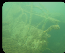
SUB SEA – LYYN gives you a clearer vision