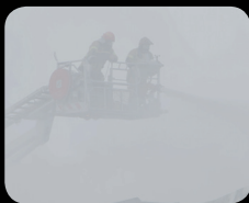
SMOKE – LYYN gives you a clearer vision