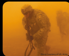
DUST – LYYN gives you a clearer vision